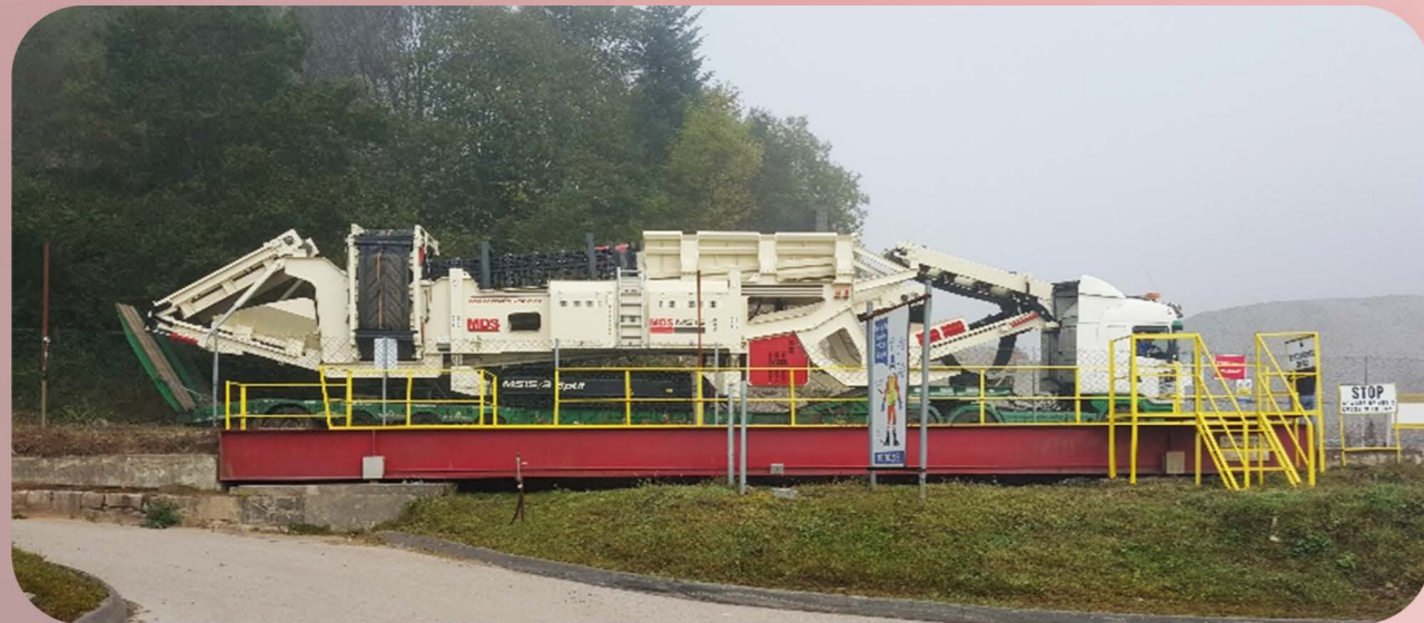
Transportation of the M515 to site, It is easily setup in under 30 minutes

Conventional scalping screens could not handle the size of the rock. Also they could not clean the material effectively. Blue decided to bring in the M515 unit, to help with the issue. The results were a very clean product, the trommel handled rock up to 800 mm or 32 inches. They also measured the M515 doing in excess of 400 TPH, so the customer was delighted with the end results.